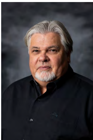
Jim Pulk Council